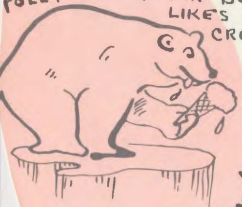
POLLY THE POLAR BEAR LIKES ICE CREAM