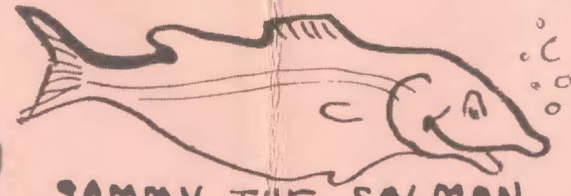
SAMMY THE SALMON LIKES ALASKA WATER