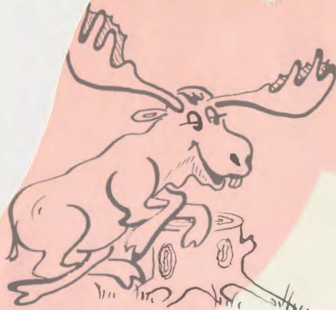
MORRIE THE MOOSE LIKES FRESH GREENS