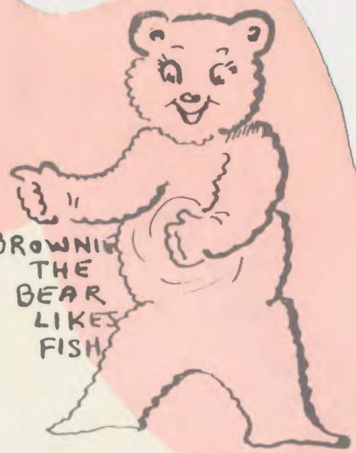
BROWNIIE THE BEAR LIKES FISH