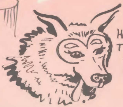
HENRY THE HUSKY LIKES MEAT