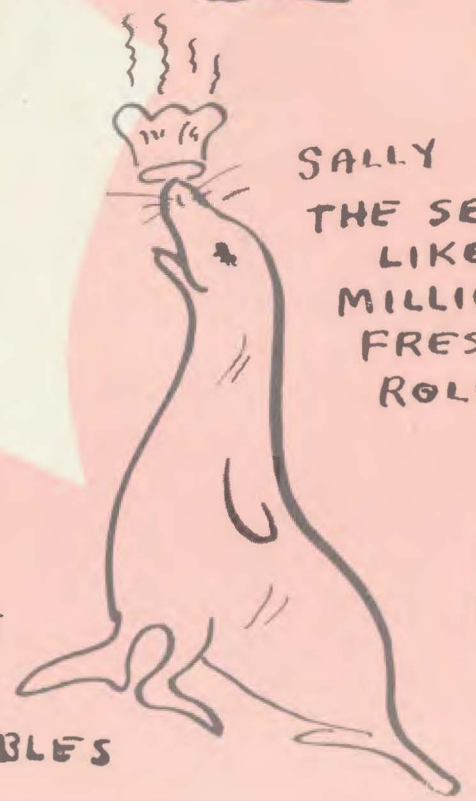
SALLY THE SEAL LIKES MILLIES FRESH ROLLS